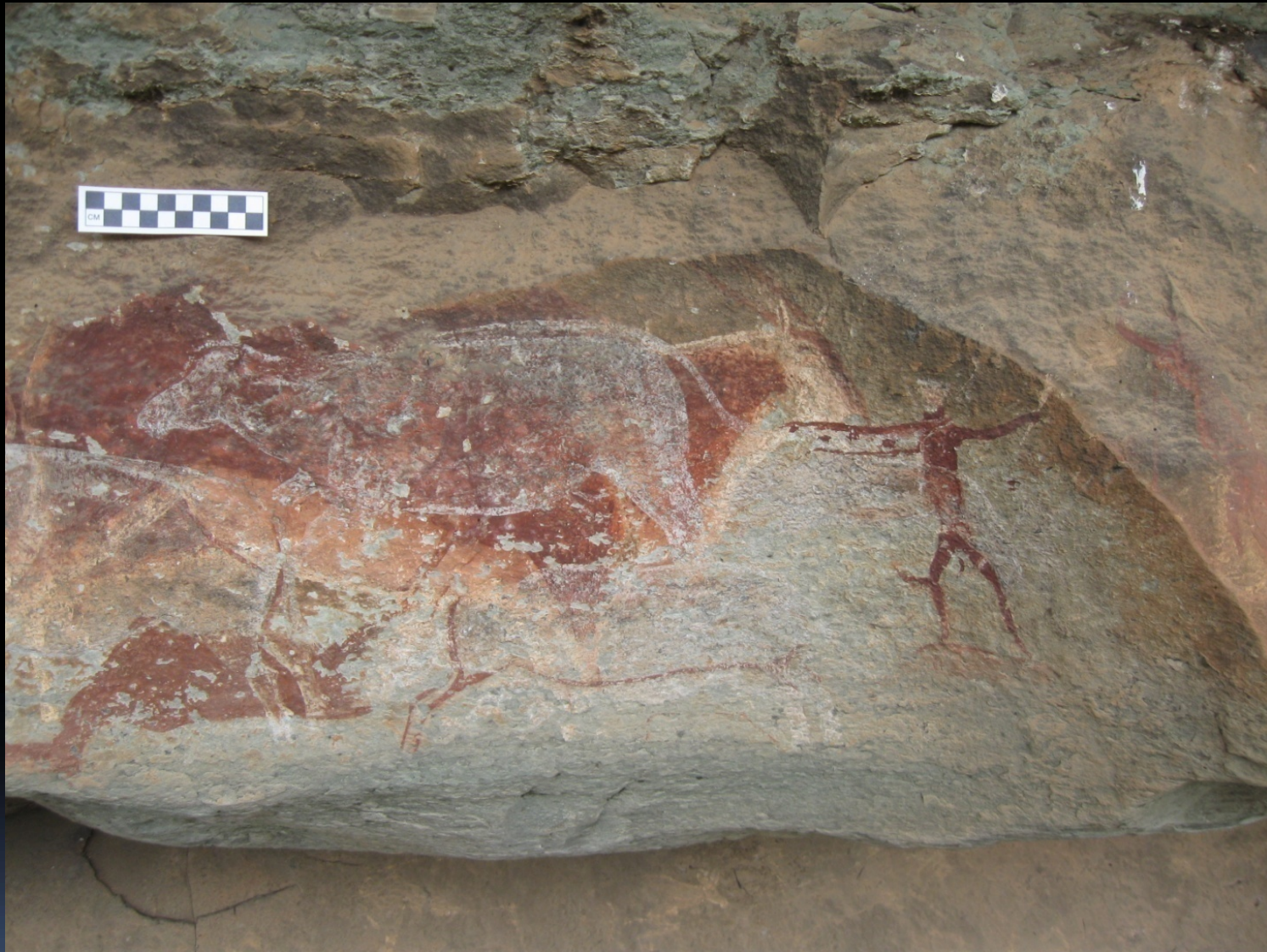
CATTLE DRAWN OVER ELAND